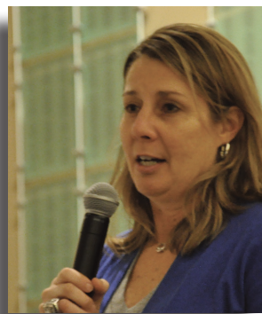
Lynx Head Coach Cheryl Reeve